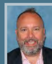
Pepe Di'Iasio Education & Skills